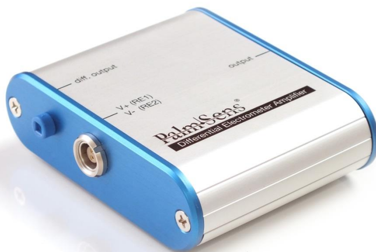
differential electrometer amplifier